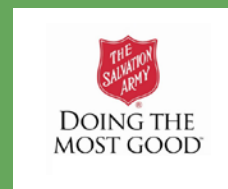
The Salvation Army Atlanta, GA